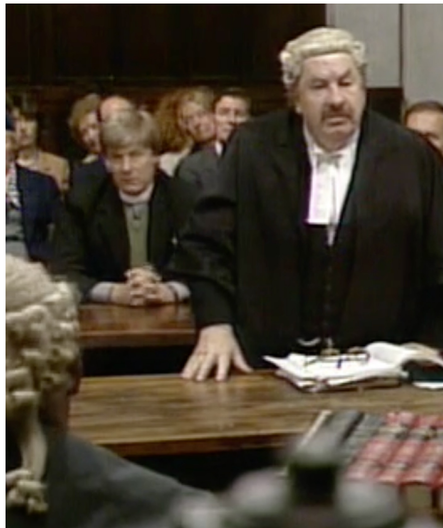
Still from "Rumpole and the Age of Miracles" (1988)